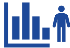
Poster Presentations by Researchers and Students