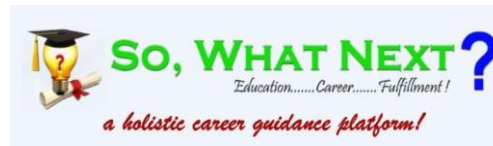
So,WhatNext? Silver Sponsor