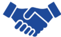
Industry EXPO for exhibiting new patents and industry solutions