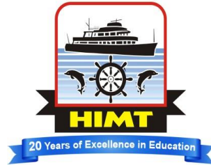
HIMT Premier Research Partner