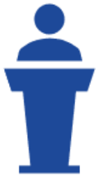
Keynote Sessions from Industry Experts