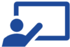
Paper Presentations by Researchers